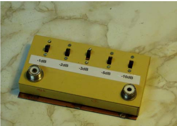
The switchable attenuator

The receiver: I have an old FT-290R where I brought-out the S-meter leads.