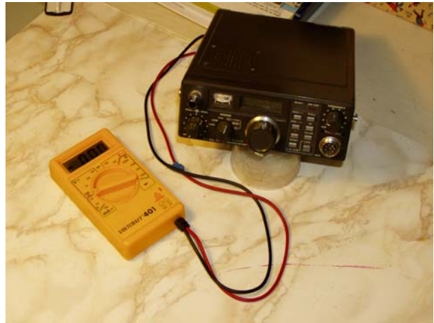
The FT-290R with the digital multimeter connected to the S-meter terminals